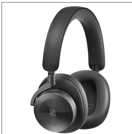
Figure 1: Example photo, colours may vary

Equipment: Bluetooth Headphone Brand: Bang & Olufsen Model name: Beoplay H95 Object of equipment: