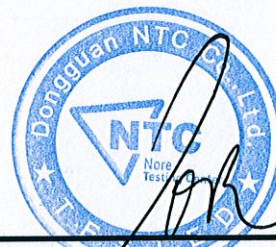
Iori Fan / Authorized Signatory

Note: This test report is for the customer shown above and their specific product only. It may not be duplicated or used in part without prior written consent from Dongguan Nore Testing Center Co., Ltd. The test results referenced from this report are relevant only to the sample tested.