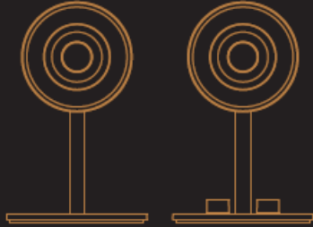
Razer Nommo Chroma 2.0 gaming speakers